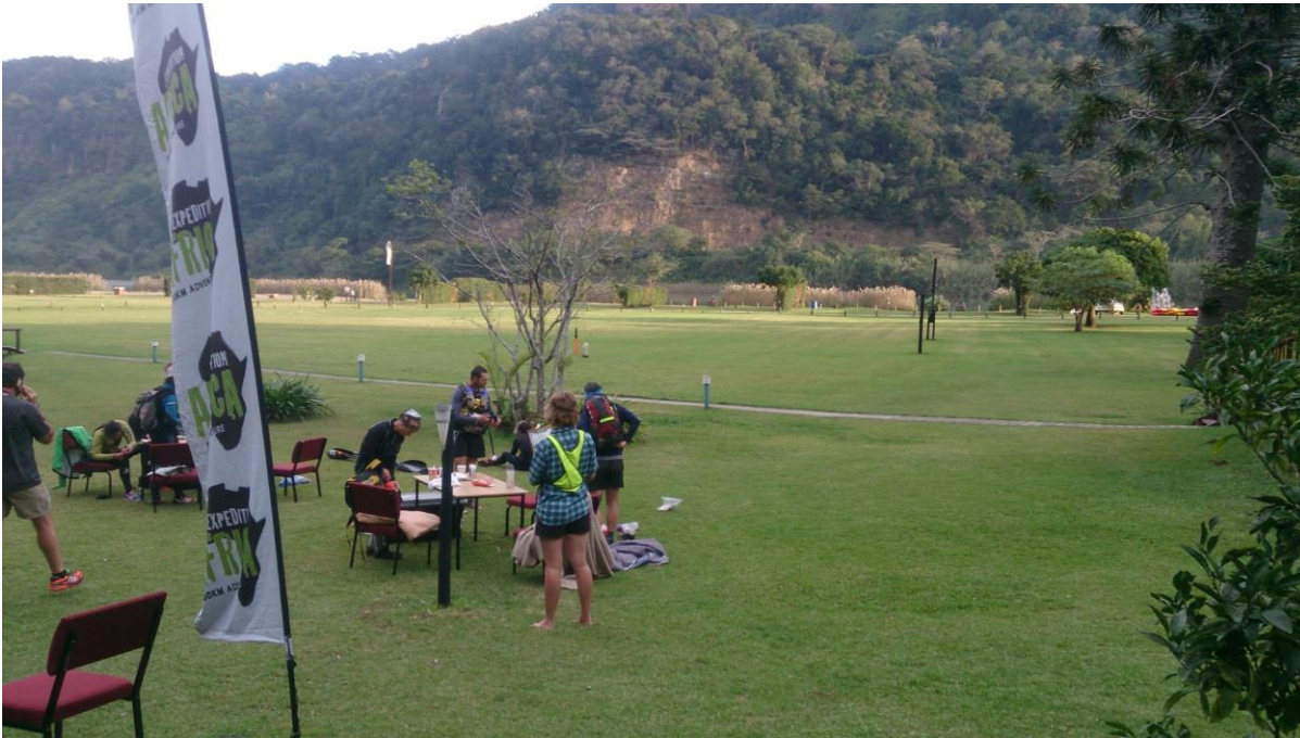
The kick ass transition at Cremorne/PSJ

earthmoving equipment half submerged in the middle of the river (or did I imagine that too?). Ultimate highlight was the final bend, and seeing the twin cliff faces of Port St Johns come into view...really a special sight as it extends to the ocean.