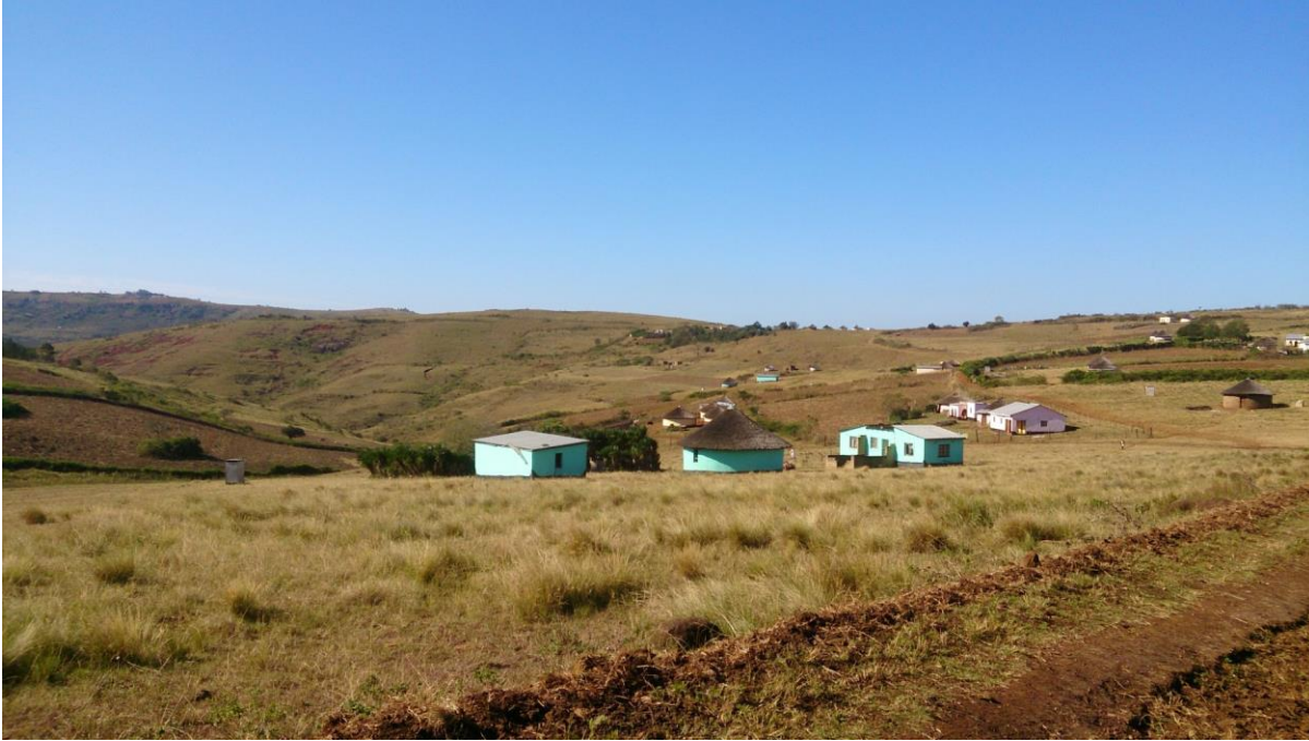
Standard view, scattered houses up and down roads, never straight!

We're playing chicken with tides again – we need to cross some rivers and get around headlands whilst it is low. Some real fun here...wait for water to recede and run to the next rocks before they all disappear under the next round of foam. Looking at photos this was an amazing section in the day that we'll be hiking in the dark. We get almost all the way through this section before all needing that big sleep stop.