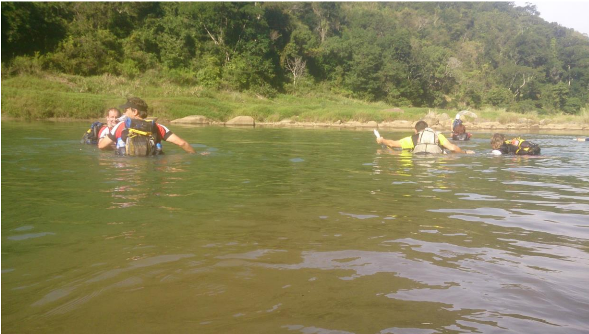
First of MANY river crossings

We had our Hollywood moment, Team Tecnu Adventures(4 th in world rankings) did something basic like forget their GPS tracker at the first transition and had to paddle back for it. It wasn't too long before they were making their way back up the field. The true professionals they were, just brushed off all the snide chirps coming their way and then allowed us to navigate the way to the next transition from the smooth wave flowing off their sterns. Such nice guys, we would see them again at the finish. It was soon evident that the only legs of racing that had flat sections were the paddling bits – even the beach stuff made you hike up a headland now and then. We were quickly thrown up a staircase type hiking trail to crest the Umtanvuna river gorge. Early days in a multi day race are fun, with teams jostling for position – oddly despite the lottery of the beach start a lot of the guys we were now around would be the ones we yo-yo'd with for the next few days.