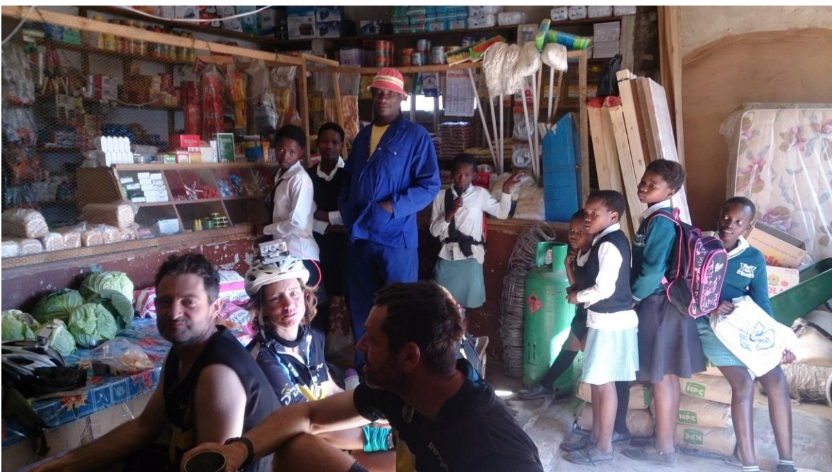
We cleared out the stock of bananas just before school was done for the day

Luckily there has been a public works program implemented in this region recently (election year maybe?). No matter how isolated a homestead is, it seems they all have a brand new pit toilet. We can all make a snide joke about who got the tender, but there are prefab concrete outhouses with bright shiny metal doors everywhere. They look very awkward and are incredibly out of character with the rest of the housing/scenery but get visited a lot by our team on this leg.