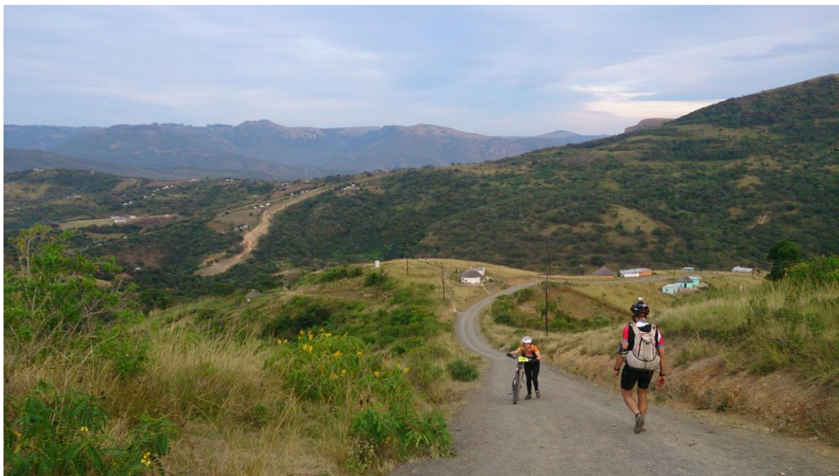
Steep steep ROADS

Team morale hit a real bummer when a) almost signing off for the leg I sent us down to the river a ridge too early [only EA team to visit that school!] b) there was a massive road coming down the hike a bike option (but not on the map). So the Tokoloshe got us in the end, we made some great gains on the leg, but then still ended up in transition with a huge bunch of teams as we all came together.