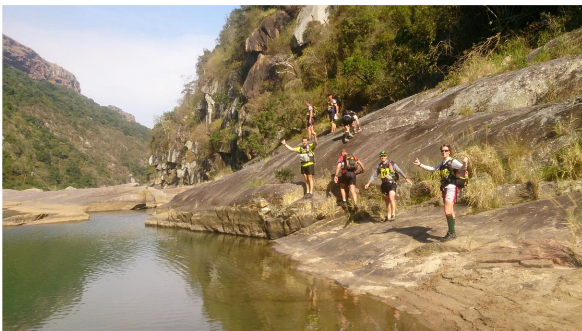
Team high jinks on leg2 river scrambling

And line up on the beach we did, 40 teams of 4 members with a pair of Fluid Synergy kayaks each – ready to punch through the short line of surf to get out to sea and head down the coast. We went all the way to the end of the row, and when more came we picked up and went further – we did NOT want to sit in traffic and took the slight penalty of further to go once at the backline. We didn't survive the first wave of swell, came mighty close but ended up rolling back to the beach. By the time we had regathered ourselves and got ready for attack two we looked up at multitudes of teams in the same predicament. Second attempt got us out, but on the way we passed our team mates who were not so lucky. The ten minutes at the backline waiting felt like eternity, surprisingly we were not backmarkers but about halfway down the field...I pity those who got pounded again and again. What a start to a 500km adventure race, a ruthlessly effective way to split the field into little chunks.