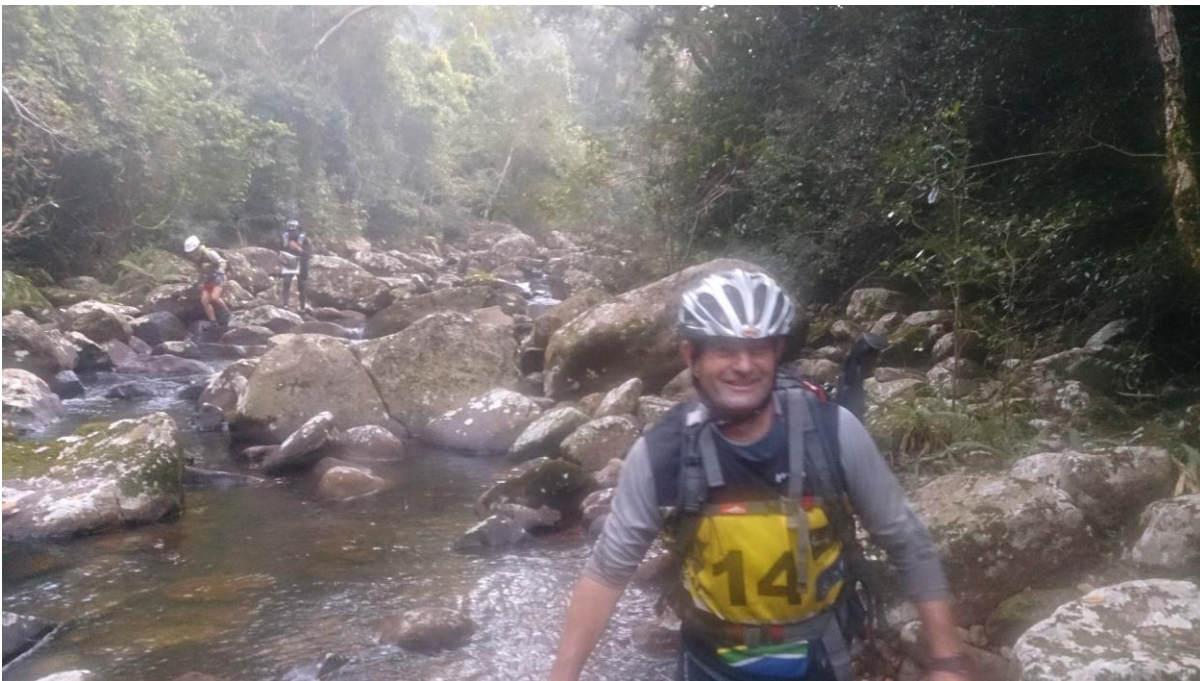
The kloof from hell, in the daylight

The plan was to get to T3 and sleep on night 2. And despite our trudgingly slow day (in the 11 daylight hours we only did about 35km...with most of it on roads,) we were on course for that just getting to the start of the kloof in the falling light. The race bible said top teams would take 5 hours to do the 10km. Seemed a bit conservative, how bad could it be?!