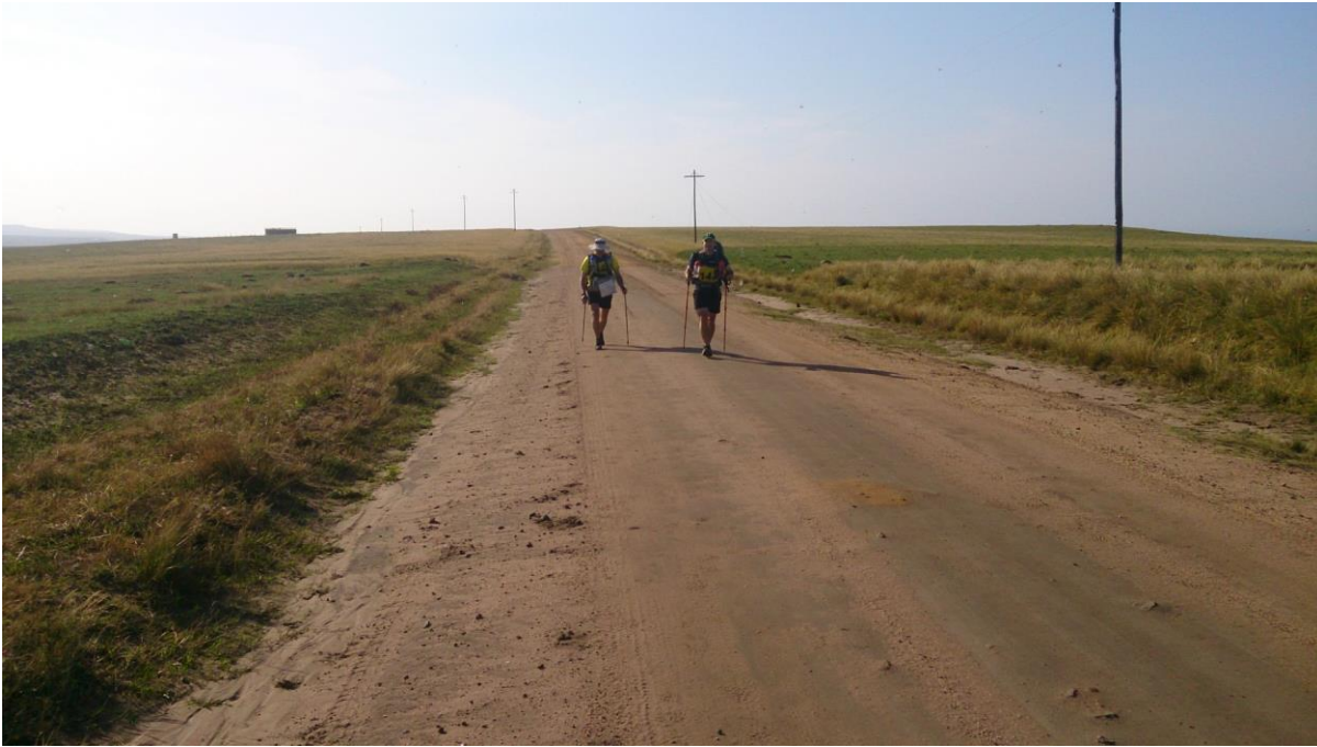
The road is L O N G

“and then it’s just a short 10km kloofing section” (Author..somewhere on leg 4)