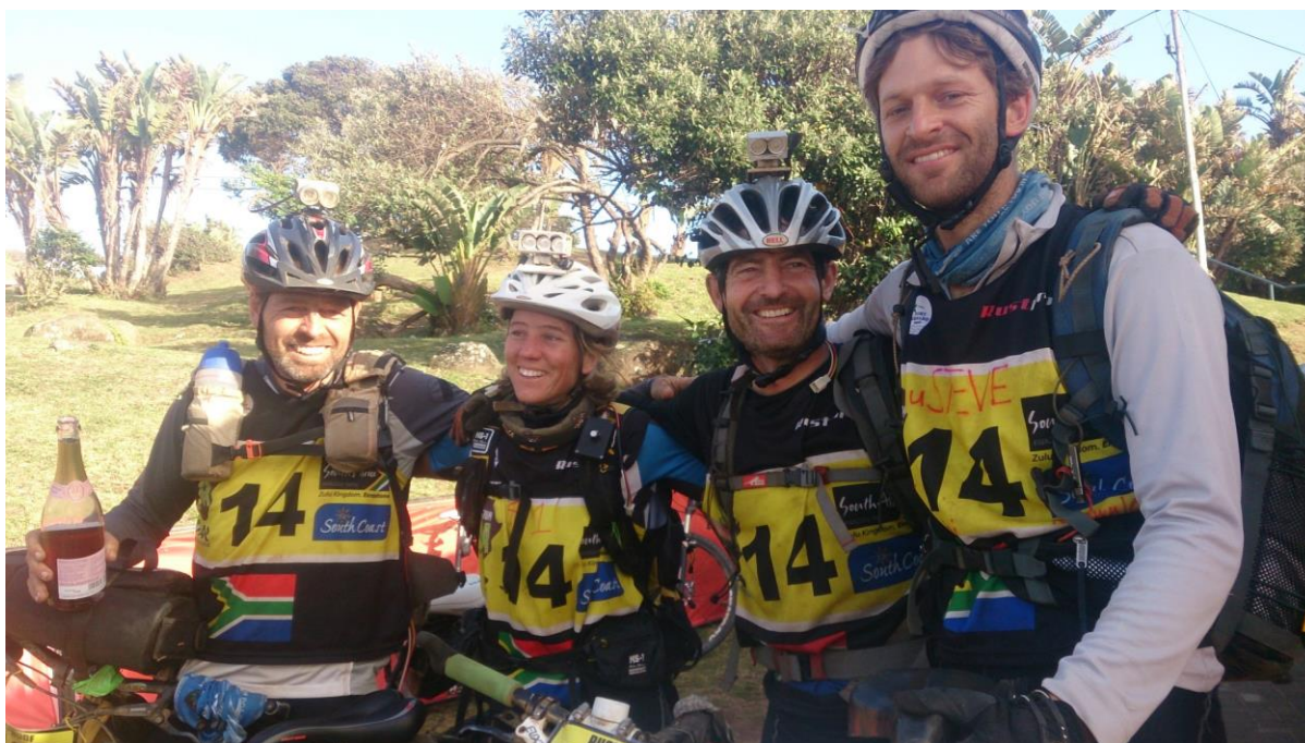
Team Rustproof finishes....eventually, all smiles now!