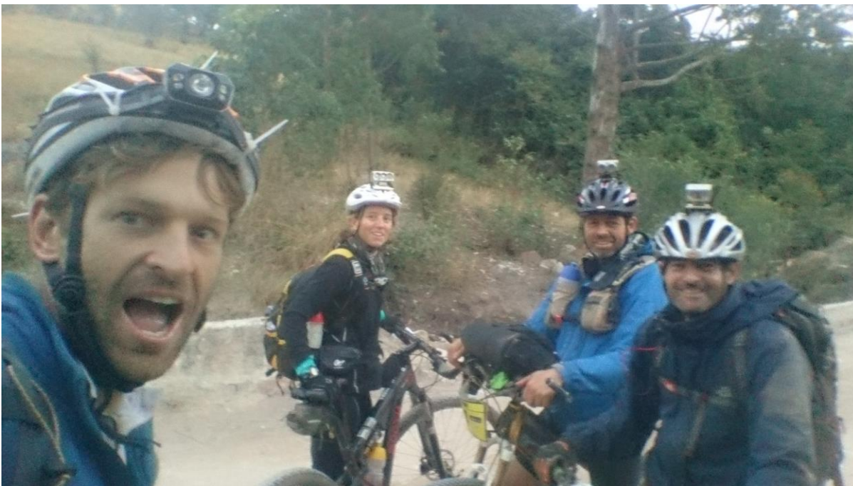
Team selfie. Got that final CP