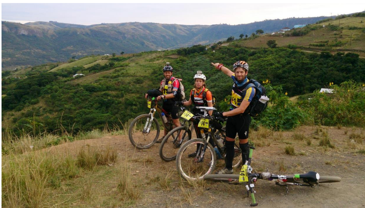
We came from there in the distance

Team morale hit a real bummer when a) almost signing off for the leg I sent us down to the river a ridge too early [only EA team to visit that school!] b) there was a massive road coming down the hike a bike option (but not on the map). So the Tokoloshe got us in the end, we made some great gains on the leg, but then still ended up in transition with a huge bunch of teams as we all came together.